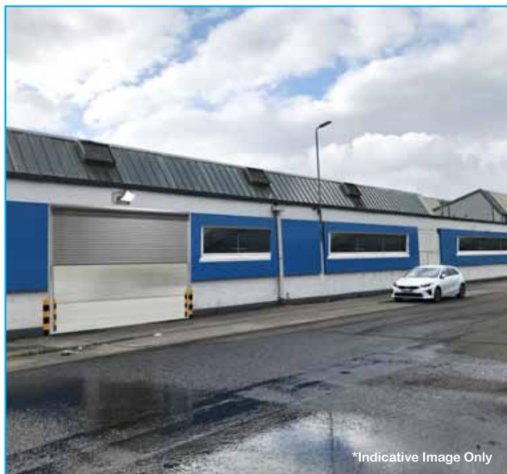
*Indicative Image Only

All prices are quoted exclusive of VAT. VAT will be payable at the prevailing rate.