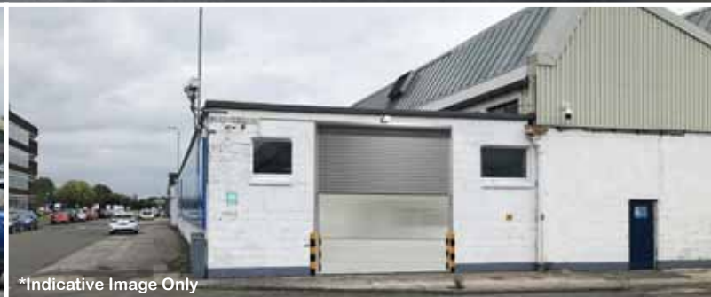
*Indicative Image Only